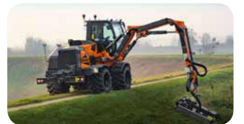
MODERN CONSTRUCTION AND MUNICIPAL SERVICES MACHINERY