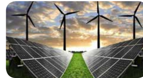
EFFICIENT USE AND RENEWABLE ENERGY SOURCES