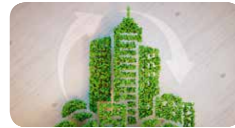
SUSTAINABLE CONSTRUCTION AND BUILDING RENOVATION