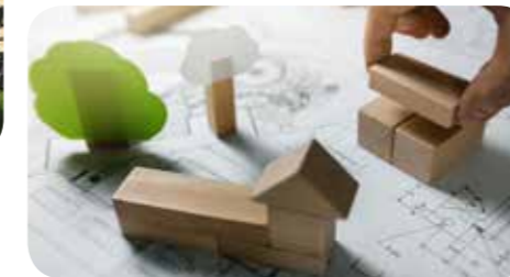
WOOD AS BUILDING MATERIAL