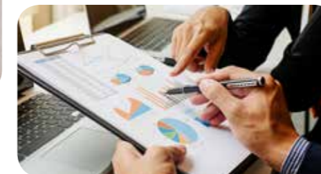
EDUCATION AND RECRUITMENT