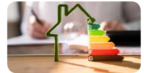
COMPREHENSIVE BUILDING RENOVATION