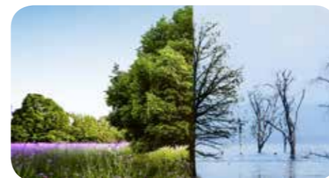
ADAPTATION TO CLIMATE CHANGE