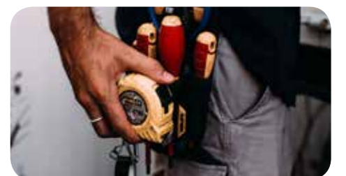
PRESENTATION OF CONSTRUCTION AND CRAFTSMANSHIP WORKS